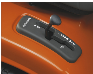
HYDROSTATIC TRANSMISSION Easy speed and direction control with a fender mounted lever.

Husqvarna's yard tractors offer premium performance with quality results. Their compact size makes them easy to maneuver and require less space for storage. Features such as fender-mounted cutting height adjustment, adjustable seat and an ergonomic steering wheel make these tractors simple and comfortable to operate. All tractors feature hydrostatic transmissions for smooth, variable forward and reverse speed. Air Induction mowing technology improves airflow within the deck, ensuring a clean, consistent cut every time. For added versatility, all models can be equipped with a range of towable accessories and mulch kit for effective lawn fertilization.