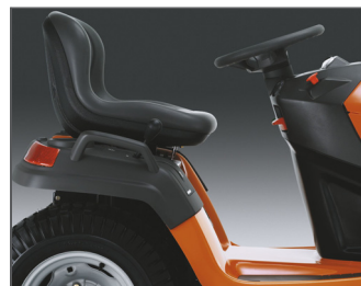
STEP-THROUGH Ensures comfortable and easy mounting and dismounting.