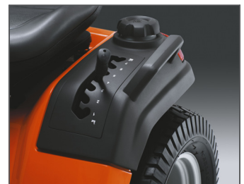
FENDER-MOUNTED CUTTING HEIGHT ADJUSTMENT Convenient fender mounted deck lever is spring assisted for easy operation.